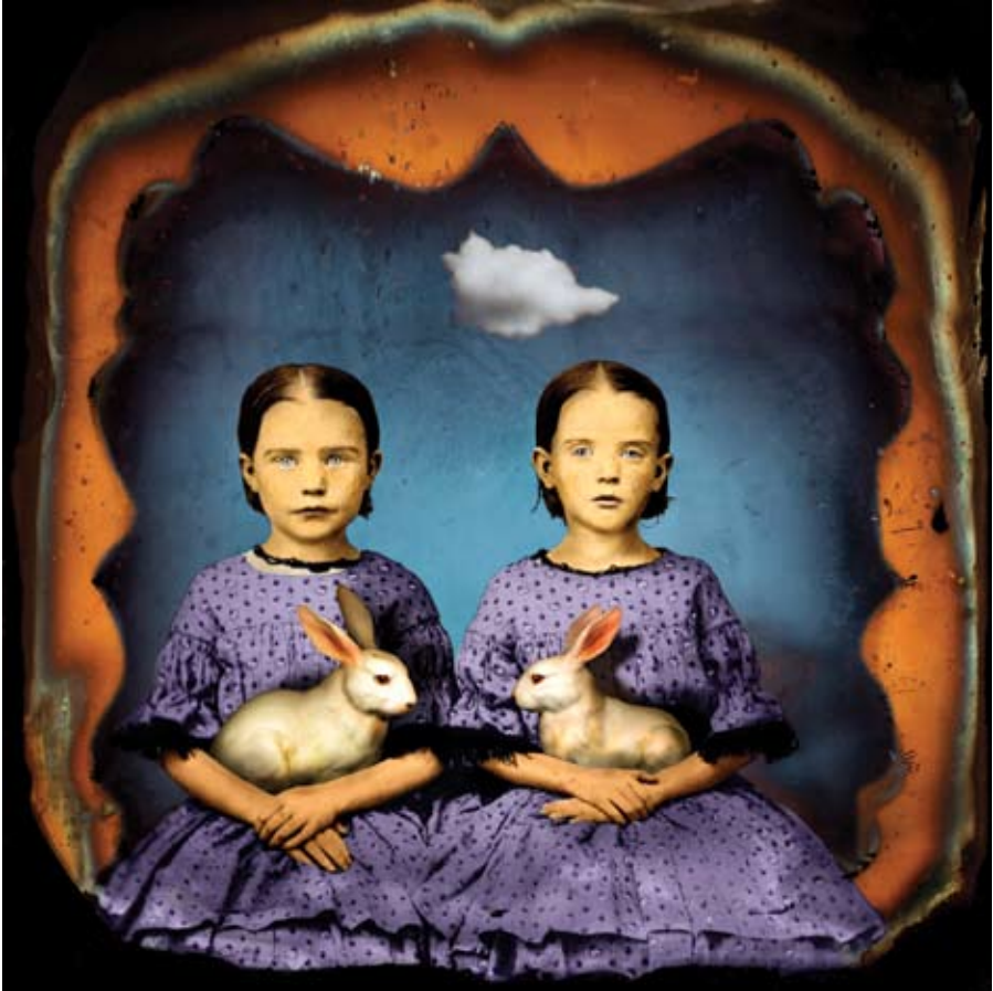
Good Girls (2003)