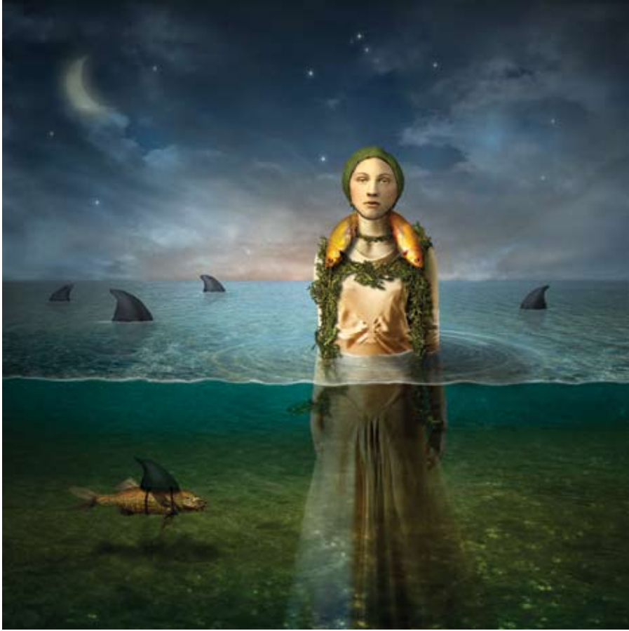
Twilight Swim (2004)