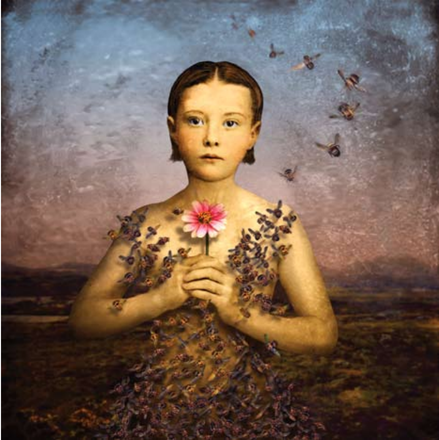
Girl with a Bee Dress (2004)